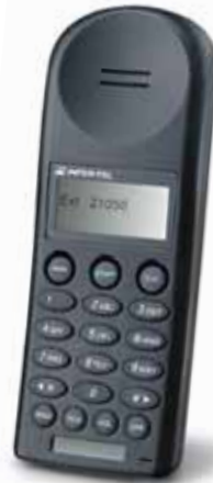
Model 8524 & 8525

Inter-Tel Model 8524 is a 900 MHz cost-effective digital wireless endpoint that facilitates the mobility of on-the-go professionals. Users can check voice mail and access system features such as initiate, conference, transfer, mute and forward calls. These models also offer a two-line alphanumeric display with icons, function keys, status indicators and speed-dial options. Inter-Tel Model 8525 additionally features a vibrate mode.